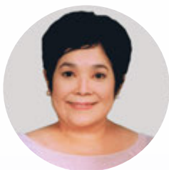
Disaster Risk Management Antonia Yulo-Loyzaga National Resilience Council